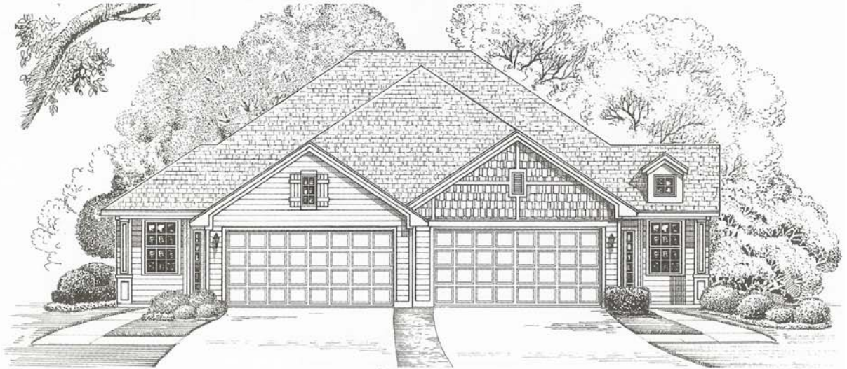
Elevation C & D