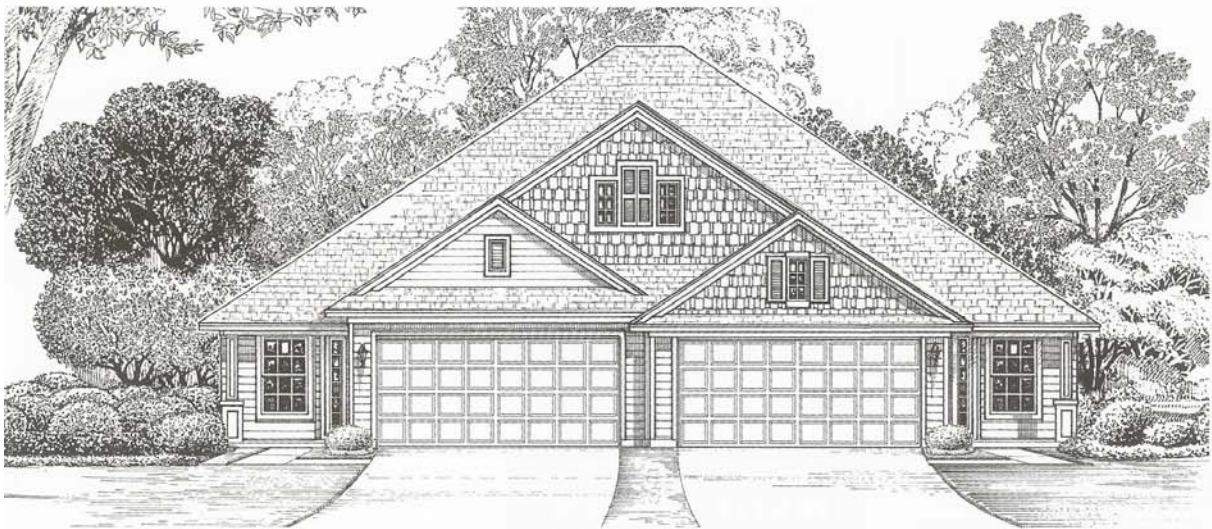
Elevation G & H