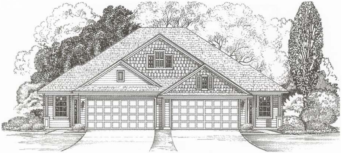
Elevation A & B